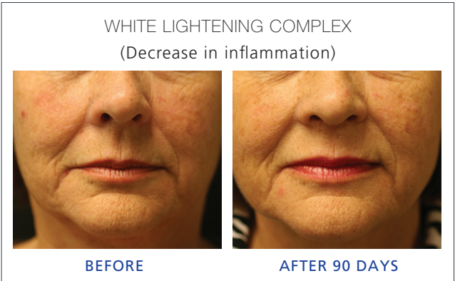
Before-and-after subject photo showing decreased inflammation of cheek area with 90 days of product use.

Furthermore, a positive ORAC score would also explain, verify, and further support the finding seen in before-and-after subject photos illustrating decreasing inflammation with product use.